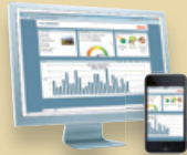
StecaGrid Portal Web portal