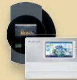
Solar-Log™ and Meteocontrol WEB'log Accessories