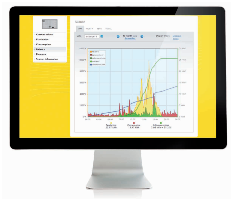
The generated output and the power consumption of the PV plant are displayed in the "Balance" section.

When used with the Solar-Log™ WEB "Commercial Edition" and either the SCB or SMB, the Solar-Log 2000 monitors every single string, ensuring the most complete and secure monitoring for large-scale PV plants with exact error identification and localization.