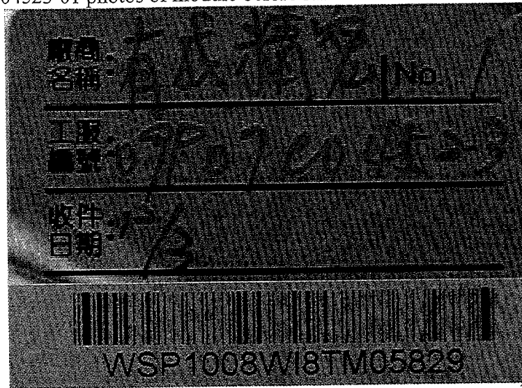
Figure 1 Label