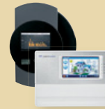
Solar-Log™ and Meteocontrol WEB'log Accessories